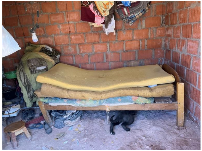
The bed in which the two women slept.