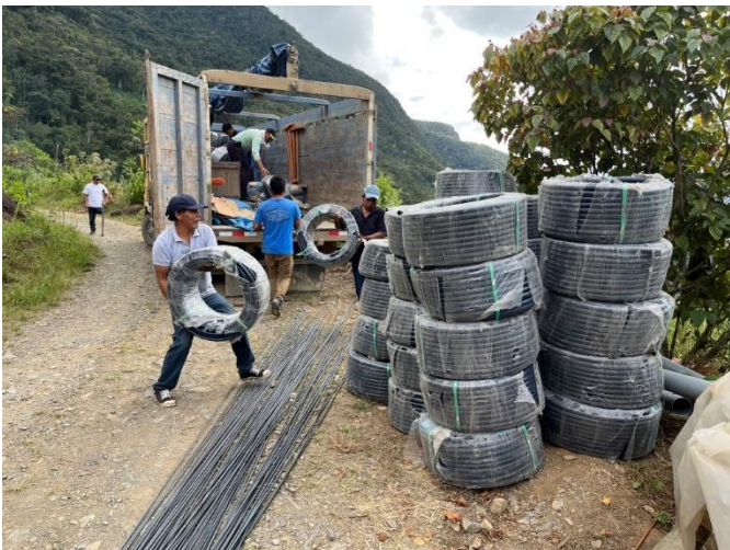
This photo shows a small proportion of the purchased materials. This included eight kilometres of hoses and pipes and hundreds of sacks of cement to complete the irrigation project.

Further photographs and details about this project can be found in the 2022 Annual Report, which can be found on our website under Projects .