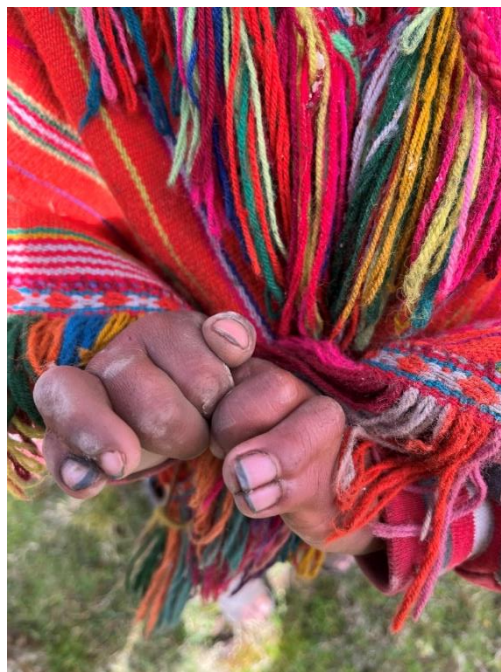
... the little finger and ring finger on both hands have fused.