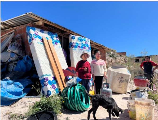
Material we purchased. One of the two water tanks can be seen in the photo; the second was purchased at a later date.