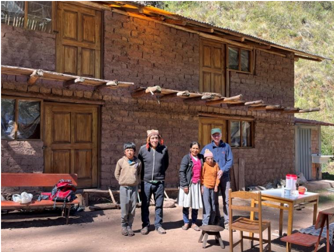
By Western standards, the house doesn't look as if it's finished, but this is how all the houses look that are made of clay bricks. The house now also has windows which are not visible on the photos.

At a cost of CHF 8,000, we had a two-storey house built for them. As the house in the photographs looks quite substantial, we should mention that part of the interior will be used for storage. This will allow the family to store their agricultural produce in a dry area, protected from mice.