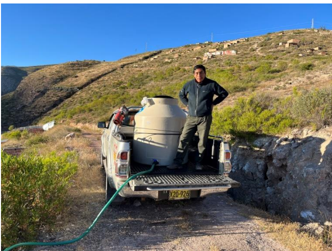
Our colleague with the water tank on the truck. The hose is used to transfer the water into the second water tank by the shack, located 50 metres below.