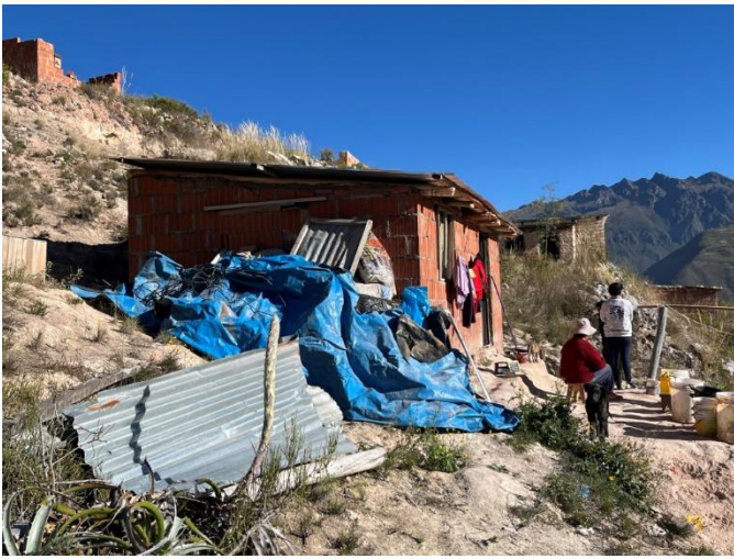
The shack in which the mother and daughter currently live.