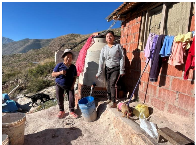
Permanently installed water tank that we had just filled. The 600-litres of water are sufficient for just under a month. Now it is possible for the two women to attend to their personal hygiene and laundry regularly.