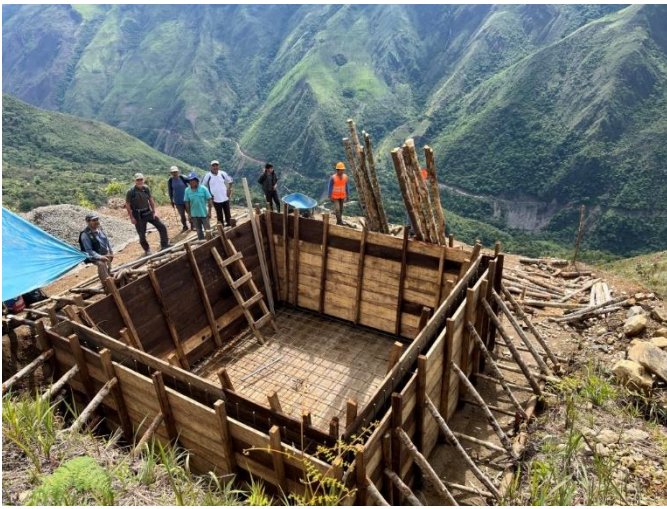
Constructing the reservoir for 10,000 litres of water.