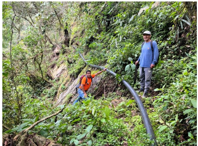
In some cases, where the terrain was impassable, water pipes had to be attached to rock faces. Wherever possible, the pipes were laid underground.