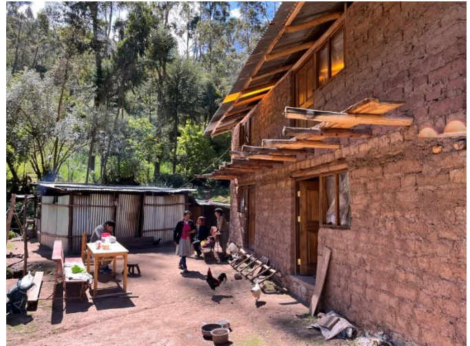
In the background, the tin shack is visible in which this family of four lived for five years in very cramped conditions. As the shack is located at 3,200 metres above sea level, it was very cold at night.