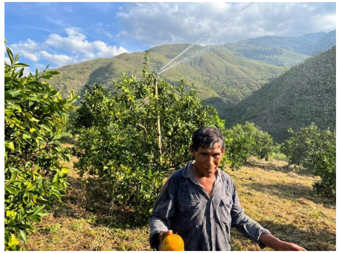
A happy farmer with one of his six sprinkler systems. His main crop is citrus fruits, which he sells.