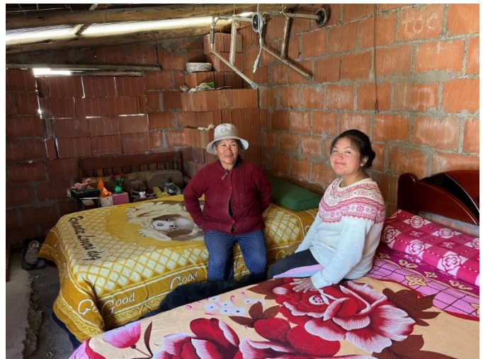
The mother and daughter are delighted to have new, clean beds. We also helped them to declutter to create more space.